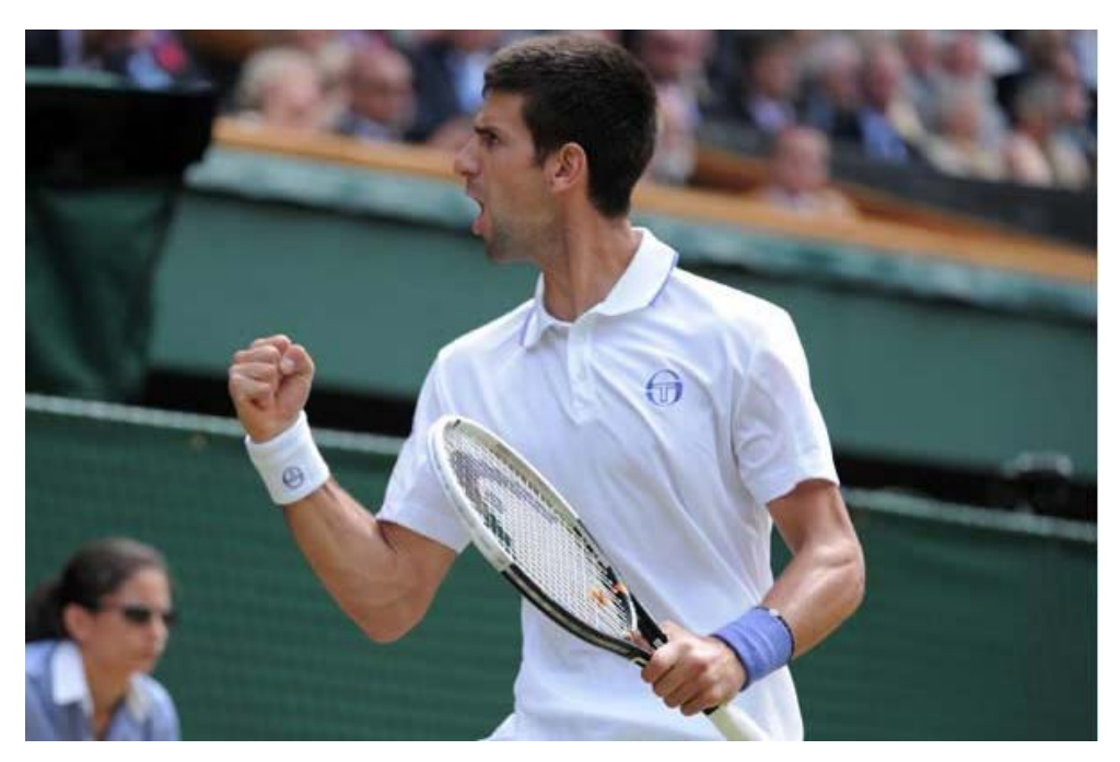
The Wimbledon Men's Singles winner, Novak Djokovic.

Some people qualified their praise with comments such as, "The actual tennis looked quite good, but I thought the drop in detail quality from HD was noticeable," and, "Having the one angle behind the players was pretty annoying. Maybe when they use more cameras it will be better".