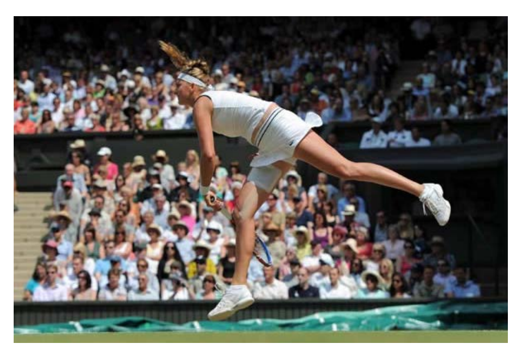
The Wimbledon Women's Singles winner, Petra Kvitova.

The BBC's 3D coverage of final stages of the Wimbledon men's and women's singles tennis was a first. The rationale for where cameras were placed and what types of shot were used is described well in our case study by Jason Coles of Can Communicate, but how did the coverage go down with the viewers?